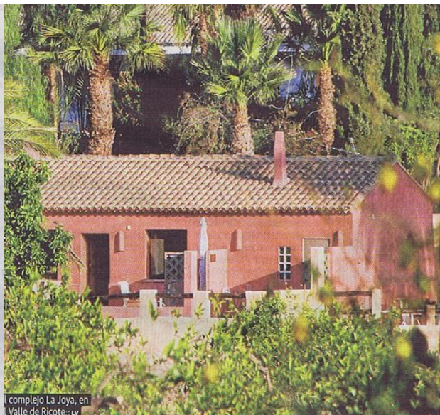
El complejo La Joya, en Valle de Ricote. iv

Cada estancia dispone de su propia terraza y el servicio de desayunos, que siempre está incluido, se sirve en este espacio al aire libre. La estancia mínima para dos personas es de dos noches -250 euros-, aunque existe la posibilidad de reservar La Noche Mágica, compuesta de una cena romántica con velas, una botella de cava y el desayuno de la mañana siguiente, además de la estancia en una de las dos suites -todo por 200 euros-. Para no romper la magia de la velada, el servicio de la cena se presenta de una vez todo emplazado y es la pareja la que marca sus ritmos como si estuviese en casa, pero cambiando el bote de Dalsy, la música de la videoconsola y los avisos de que ha terminado el ciclo de la lavadora como telón de fondo por velas, aromas a azahar y burbujas en altas copas de cristal. ¿Apetece?